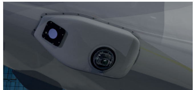
Multiple EASA civil certified STCs

For more information: miysisdircm.team@leonardo.com