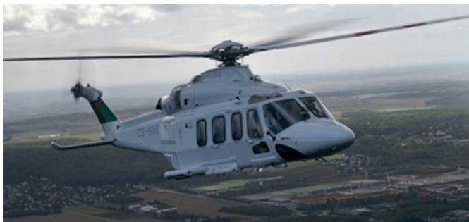
Fixed and rotary wing application